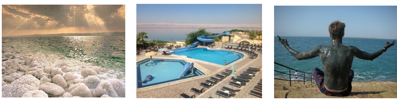
beauty. Overnight in Dead Sea.

The Dead Sea is flanked by mountains to the east and the rolling hills of Jerusalem to the west, giving it an almost other-worldly